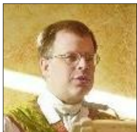
Bonaventure—Major Life of St. Francis (1263)

(Lk 16, 15). He often used to remark, “What a man is before God, that he is and no more,” Consequently he was convinced that it was foolish to be elated when people showed him marks of respect; he was upset by praise, but overjoyed when he was insulted. He liked to have people scorn him—that spurred him on to do better—and hated to be praised, which could lead to a fall. When people praised the height of his sanctity, he used to command one of the friars to do the opposite and heap insults on him. Then, as the friar obeyed reluctantly and called him a boor and a time-server, worthless and good for nothing. He would listen cheerfully and say with a smile, “God bless you my son. What you say is true. That is the kind of thing the son of Peter Bernadone should have to listen to.”