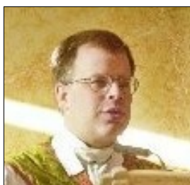
Bonaventure—Major Life of St. Francis (1263)

eat; he was overjoyed at seeing the saint's exquisite tact which enabled him to relieve his material needs and gave him such a wonderful example. In the morning Francis called the whole community together and told them what had happened, taking the opportunity to tell them, "You should take an example from the charity involved, not from the fact that we indulged in food." He also taught them to practice prudence, not the prudence recommended by our fallen nature, but that practiced by Christ whose life is the model of all perfection.