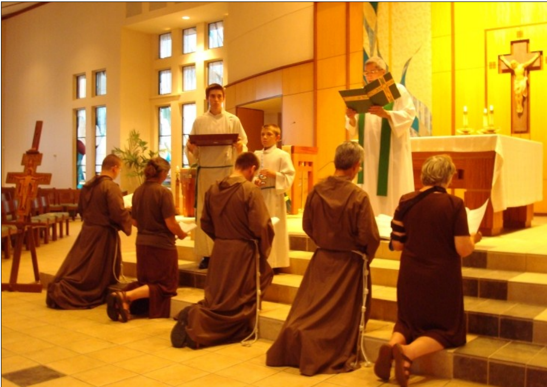
The "Golden" Profession